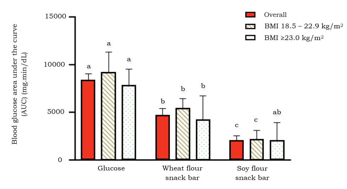
Figure 3. Blood glucose area under the curve (AUC). SF snack bar has lower blood glucose AUC level (p<0.05) than WF snack bar or glucose standard.

The present study found significantly lower blood glucose level and low GR with a maximum peak of 140.0±21.9 mg/dL and >20% lower AUC after the ingestion of SF snack bar in T2DM subjects. This glycaemic control benefit is most probably related to soy flour's nutritional properties, i.e. low in carbohydrate and high in fibre, protein and isoflavones content (Mohammed, 2019), which distinguishes it from wheat flour. Although the mechanism of action is unknown, it is believed that the glycaemic control benefit may be linked to dietary fibre (DF), protein (DP) and isoflavones' physicochemical properties (Rivero-Pino, Espejo-Carpio & Guadix, 2020; Kurylowicz, 2020; Goff et al., 2018).